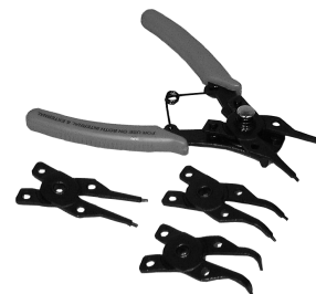
No. 63-8006 Snap Ring tool set

This tool set comes complete with 4 sets of interchangeable jaws. It can be used for both internal and external snap ring retainer clips. The tool can be used with an effective range of 3/8" to 2" (10-50mm). There are jaws for 45°, 90°, 180°, Straight. The jaws are quickly and easily changed.